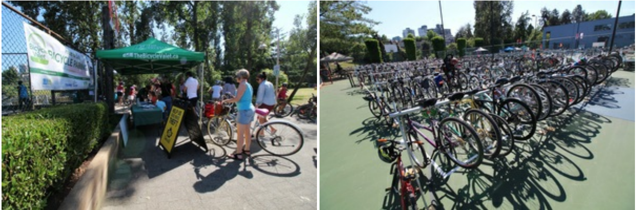
Massive crowds parked their bikes at the Granville Island tennis courts on Canada 150.

For more information on anything Bicycle Valet, please contact Anita at anita.man@best.bc.ca or (604) 767-3393, or sign up now if you'd like to volunteer.