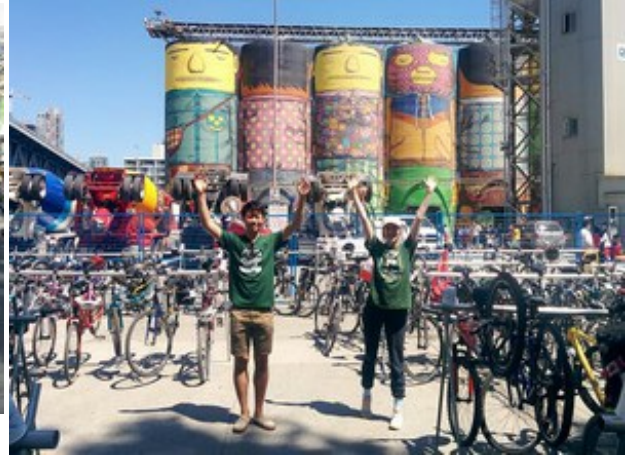
Four- and two-legged friends celebrate a record-breaking Canada 150+ at Ocean Concrete on Granville Island.

The Bicycle Valet's summer so far has been nothing short of enthralling -- and the excitement shows no signs of stopping! To kick things off, on Canada Day we broke our own record by parking 2,437 bikes across 8 different locations! We've also been particularly busy at Whitecaps games at BC Place -- breaking another single-game record early in the month by parking 318 bikes during the match against New York City.