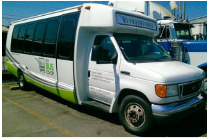
This beautiful 12-seat shuttle bus helps seniors stay active.