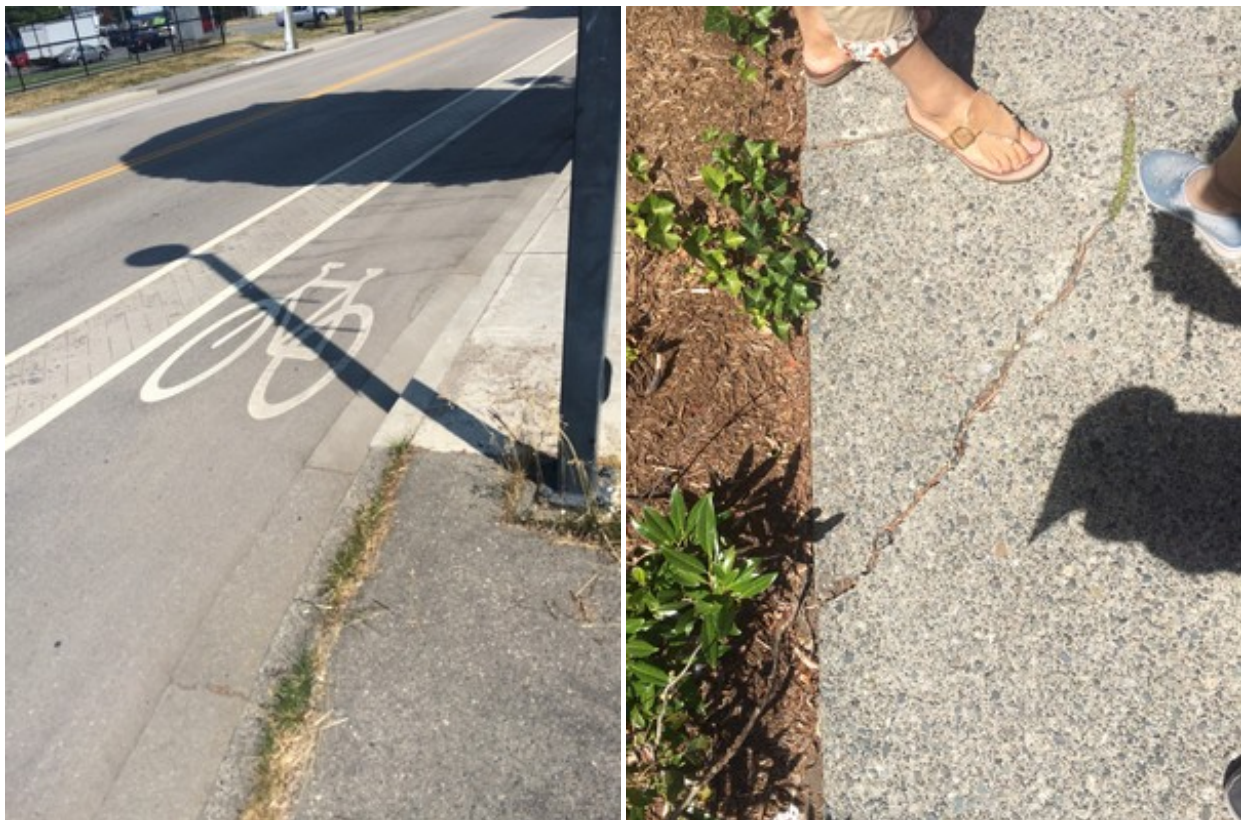
Some examples of good and bad street features that were noticed during our street audits with S.U.C.C.E.S.S. and the YMCA.

Living Streets had a busy month in July as BEST staff and volunteers explored areas in Guildford and Central Surrey, with help from community groups from S.U.C.C.E.S.S. and the YMCA. Participants identified many areas in need of improvement, including cracked and discontinuous sidewalks, dangerous intersections, and bus stops in need of rain shelters. However, they also noticed a lot of positive street features like separated bike lanes, transit-oriented development and other interesting uses of urban design. Our recent charrette event with the City of Surrey at the Bing Thom-designed City Centre Library highlighted these positive changes, which seemed to signal Surrey's transition into more of an urban centre in BC's Lower Mainland.