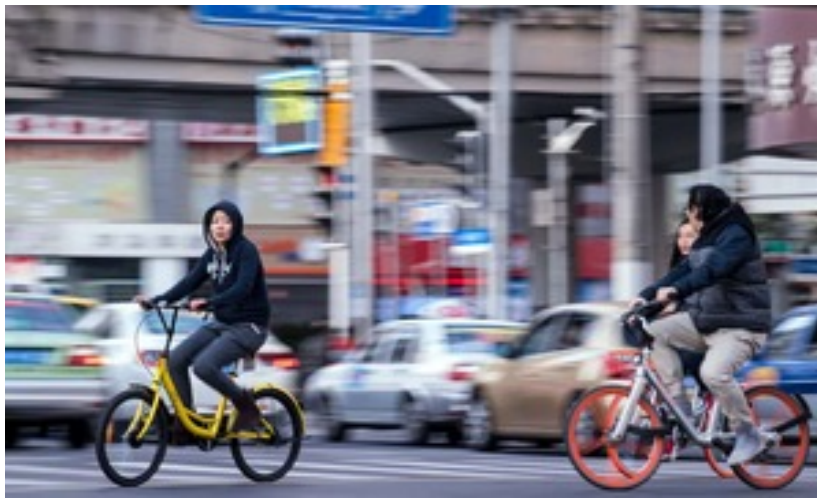
Dockless app-based systems have taken off in China.

While technology can be a game-changer for transportation, the real innovations are not what many think. Forget the Hyperloop, driverless cars and electric vehicles for a moment. The real revolution is more a renaissance of what has always worked in cities: walking and cycling. With city infrastructure to match, technology has allowed the advent of bikeshare programs, such as our own Mobi bikeshare . But as technology increases, new models of bikeshare are being tested.