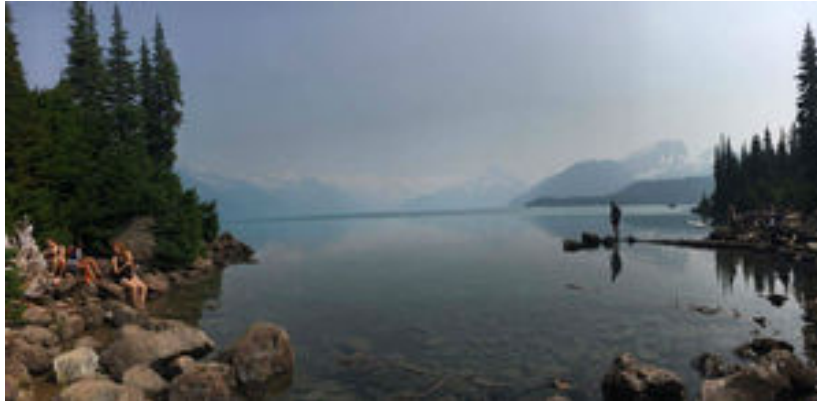
Garibaldi Lake was one of the many beautiful destinations Parkbus headed to this season.

After an extremely successful summer, Parkbus BC had its last run of the season on September 30, with a trip up to Joffre Lakes. Like last year's pilot runs, the response to the offering of express bus service to BC Provincial Parks has been outstanding, with most trips being sold out! With so much success, we look forward to expanding again in 2018. Highlights from our 2017 season include: