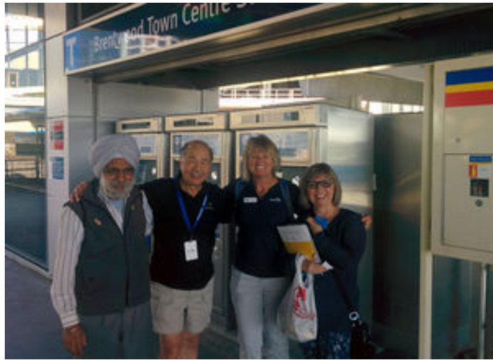
A few participants in the transit training workshop in Burnaby. Thanks TransLink!

As a Collective Impact project under Allies in Aging , Seniors on the Move is working with as many seniors transportation stakeholders as possible. On September 21 we teamed up for a Seniors Advisory Committee meeting with the Office of the Seniors Advocate, who is preparing a report on transportation in the province. Gathering at ICBC in North Vancouver, seniors from across Metro Vancouver had the opportunity to share their experiences using different transportation modes and to discuss potential solutions to improving and increasing options.