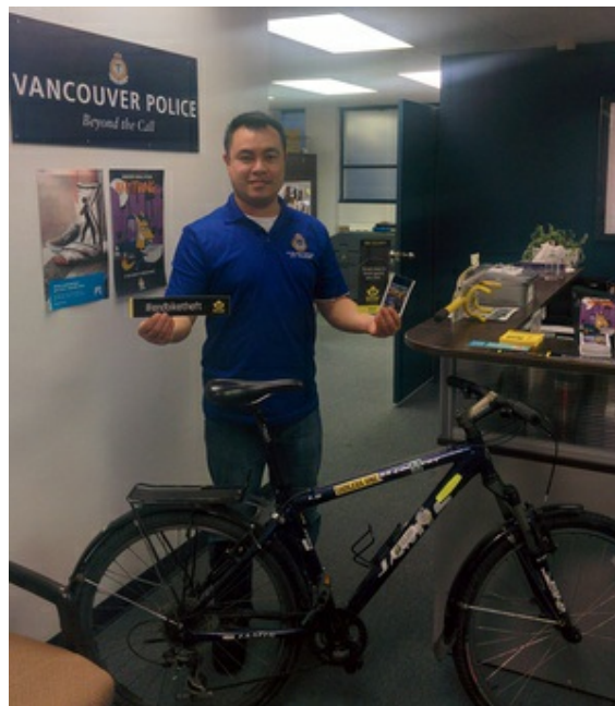
Staff at the Community Policing Office reintroduce our GM to her beloved bicycle