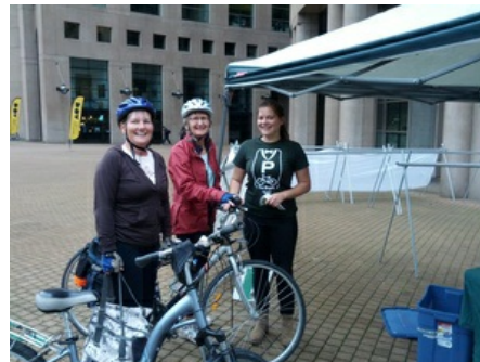
The first customers of the day at VPL!

The Bicycle Valet 2014 season is winding down – but it's not over yet! This past Saturday we were set up at the three locations of the first Doors Open Vancouver: City Hall, False Creek Flats, and Vancouver Public Library. #DoorsOpenVan is a one-day event that invites the public to enjoy free, behind the scenes access to popular Vancouver buildings and learn about civic services while experiencing Vancouver's architectural, design, engineering and cultural heritage.