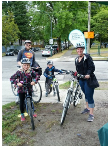
Arriving on 2 wheels -- Bike to the Nat!

The Bicycle Valet 2014 season is winding down – but it's not over yet! This past Saturday we were set up at the three locations of the first Doors Open Vancouver: City Hall, False Creek Flats, and Vancouver Public Library. #DoorsOpenVan is a one-day event that invites the public to enjoy free, behind the scenes access to popular Vancouver buildings and learn about civic services while experiencing Vancouver's architectural, design, engineering and cultural heritage.