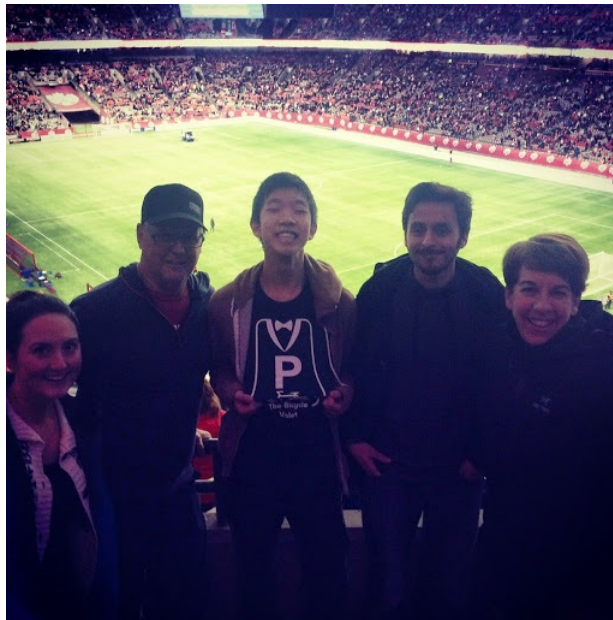
At the FIFA Mexico v. Canada game: Volunteering has its perks!

The Bicycle Valet had a great first month in March, with volunteers enjoying themselves at the Modo Spring Run-Off, Whitecaps games, and the FIFA Men's Qualifier match between Canada and Mexico! Wondering where we'll be next?