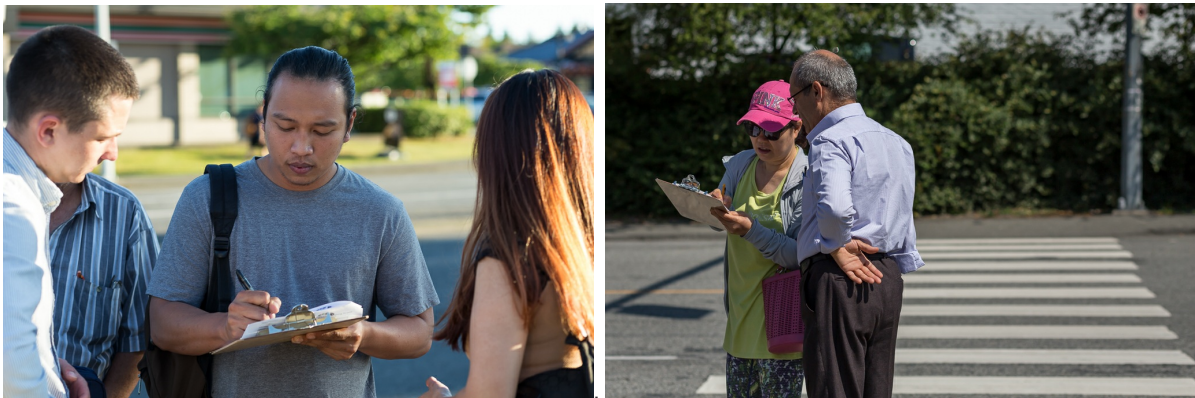
Living Streets participants fill out street audit forms in their communities.

Living Streets staff and volunteers have had an exciting summer engaging citizens and auditing streets in Surrey, White Rock, and Coquitlam. We've worked with youth and new Canadians and had some great discussions about what makes our streets work for sustainable transportation and what still needs improvement. All in all we've interacted with over 250 community members and conducted over 50 street audits. We have one more event to attend this summer, and then all the data collected over the season will be mapped and put to work in a community near you!