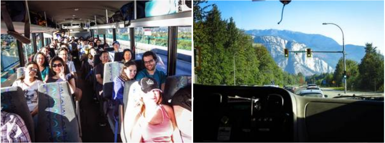
Contented Parkbus passengers cruise along the Sea-to-Sky Highway (I); approaching the Chief in Squamish.

BEST is very excited to be involved in bringing to BC this innovative service supporting sustainable transportation - and we're looking forward to seeing how this initiative evolves in 2017!