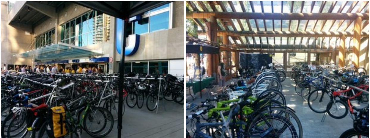
We kept packing them in at the Whitecaps (!) and Granville Island!